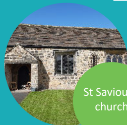
St Saviour's church

over 30 years and is now home to a Plant Heritage National Collection of roses.