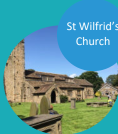
St Wilfrid's Church

1. St Wilfrid's church is predominantly a medieval building. The chancel and parts of the nave and vestry date back to the 1220s. The oak beamed roof was repaired in 1527 and it's likely that the tower was built around this time. The sundial in the churchyard is 17th century, however the steps up to it are more likely 13th or 14th century.