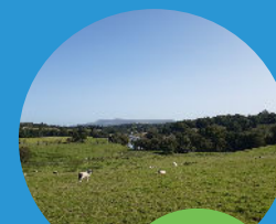
Views of Dinckley

In the next field, head diagonally left, round the right-hand side of the copse of trees. Follow the Ribble Way fingerpost (part-way up the hill) to a stile. Once over the stile, cross the field towards the fingerpost on the opposite side. Go through the gate and turn left onto the track. Go through the farmyard and follow the track to the main road (roughly 1 mile).